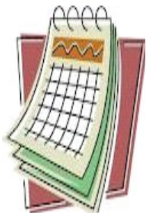
Calendars that hang on the wall of your house tell you what the seventh day is.