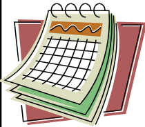
Calendars that hang on the wall of your house tell you what the seventh day is.

the nations (stranger) to observe as an everlasting (perpetual) covenant and was a sign that you worship the true and living God. “...It is a sign between me and the children of Israel for ever : for in six days the LORD made heaven and earth, and on the seventh day he rested, and was refreshed. And he gave unto Moses, when he had made an end of communing with him upon mount Sinai, two tables of testimony, tables of stone, written with the finger of God. (Exo. 31:12-18). The Lord also gave us a way to tell when it starts and ends. If you read the account in Genesis 1, it says that the evening starts a day. He also gave us the sun and moon to determine this: “...Let there be lights in the firmament of the heaven to divide the day from the night; and let them be for signs, and for seasons, and for days, and years: ...And God made two great lights; the greater light to rule the day, and the lesser light to rule the night: he made the stars also..” (Gen 1: 14-16).