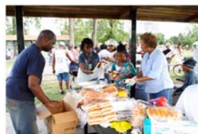
Israel of God Buffalo annual Food and clothing give away