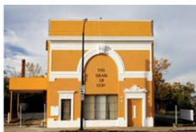
Israel of God Buffalo